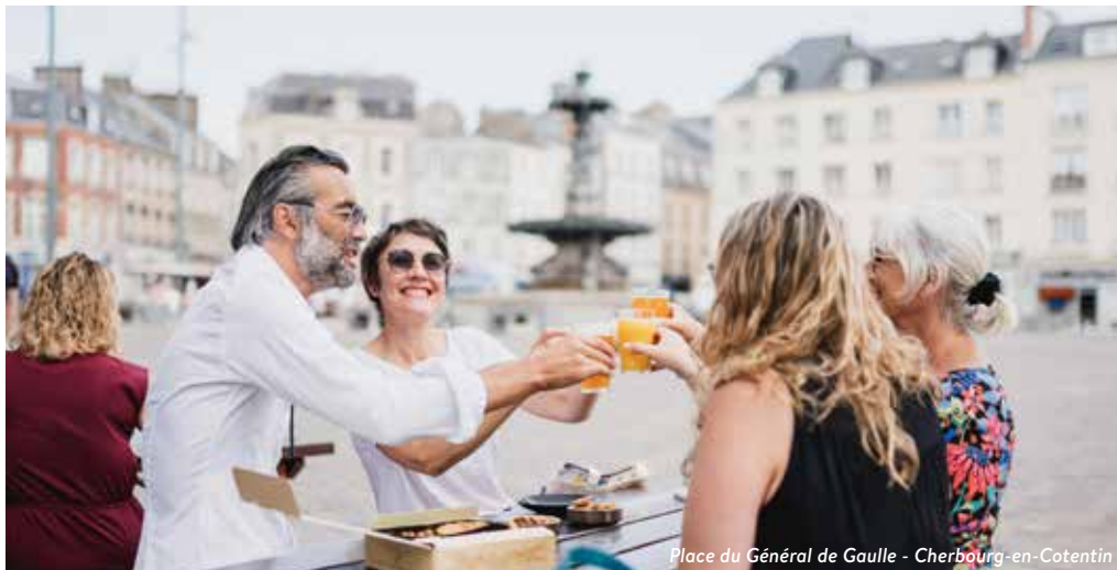
Place du Général de Gaulle - Cherbourg-en-Cotentin