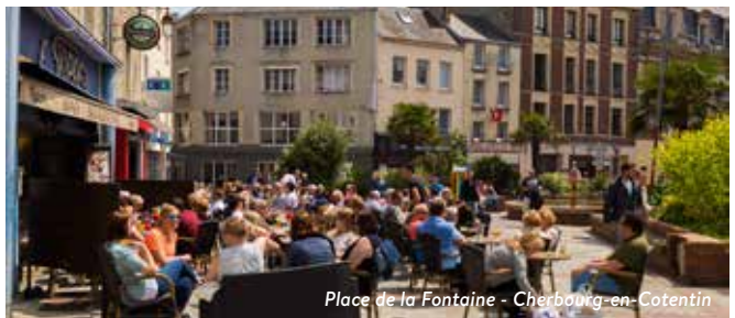
Place de la Fontaine - Cherbourg-en-Cotentin