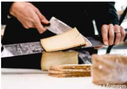
Cave à Fromages

Stroll from shop to shop in Cherbourg-en-Cotentin, and step inside to find cheese at the Cave à Fromages , beer and cider at Beer'Z , and wine at the Cave du Roy . You can also try local oysters at the Comptoir des Halles .