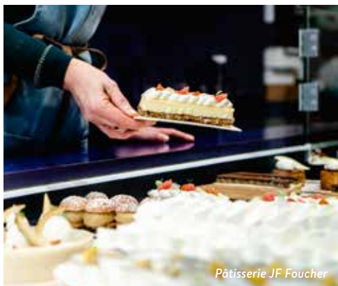
Pâtisserie JF Foucher

Savour a sweet treat prepared by a chef at the Pâtisserie Foucher and enjoy real coffee the French way at Les Saveurs d'Antan . Give in to the sweet temptation at the Pâtisserie Yvard and the Chocolaterie de Neuville . Taste delicious French macaroons from Le Monde des Macarons or the excellent traditional lemon cake from Café Pompon . Stop by Le Caffé , enjoy a cosy setting with their tasty signature cheesecake.