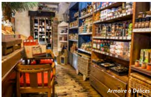
Armoire à Délices

Find bargains in the second-hand shops, Culture Seconde . Sweet Cabana , full of decorative items and gift ideas to suit every budget in Art et Création .