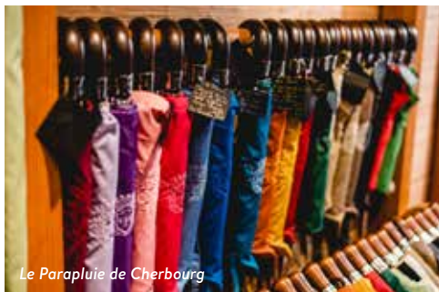
Le Parapluie de Cherbourg

Casino Shop open from Monday to Friday (closed Wednesdays) 8.30am - 8pm, and Saturdays and Sundays 9am - 8pm.