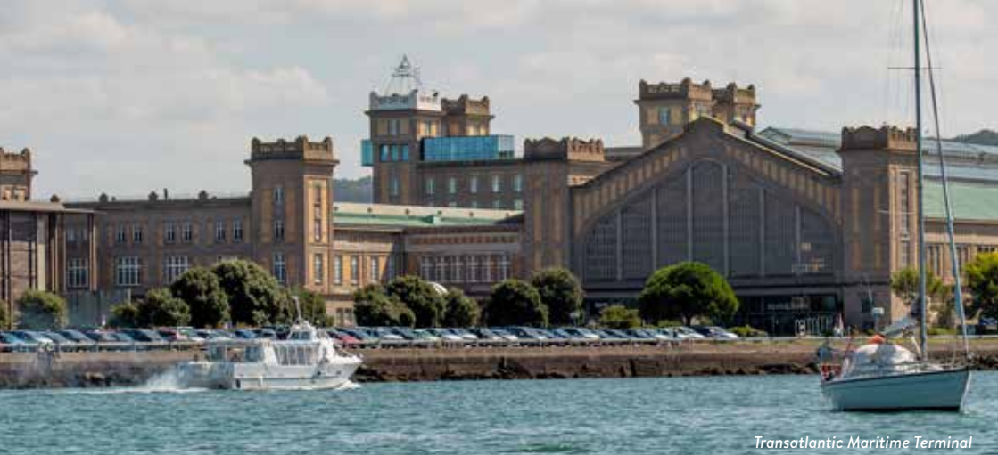
Transatlantic Maritime Terminal